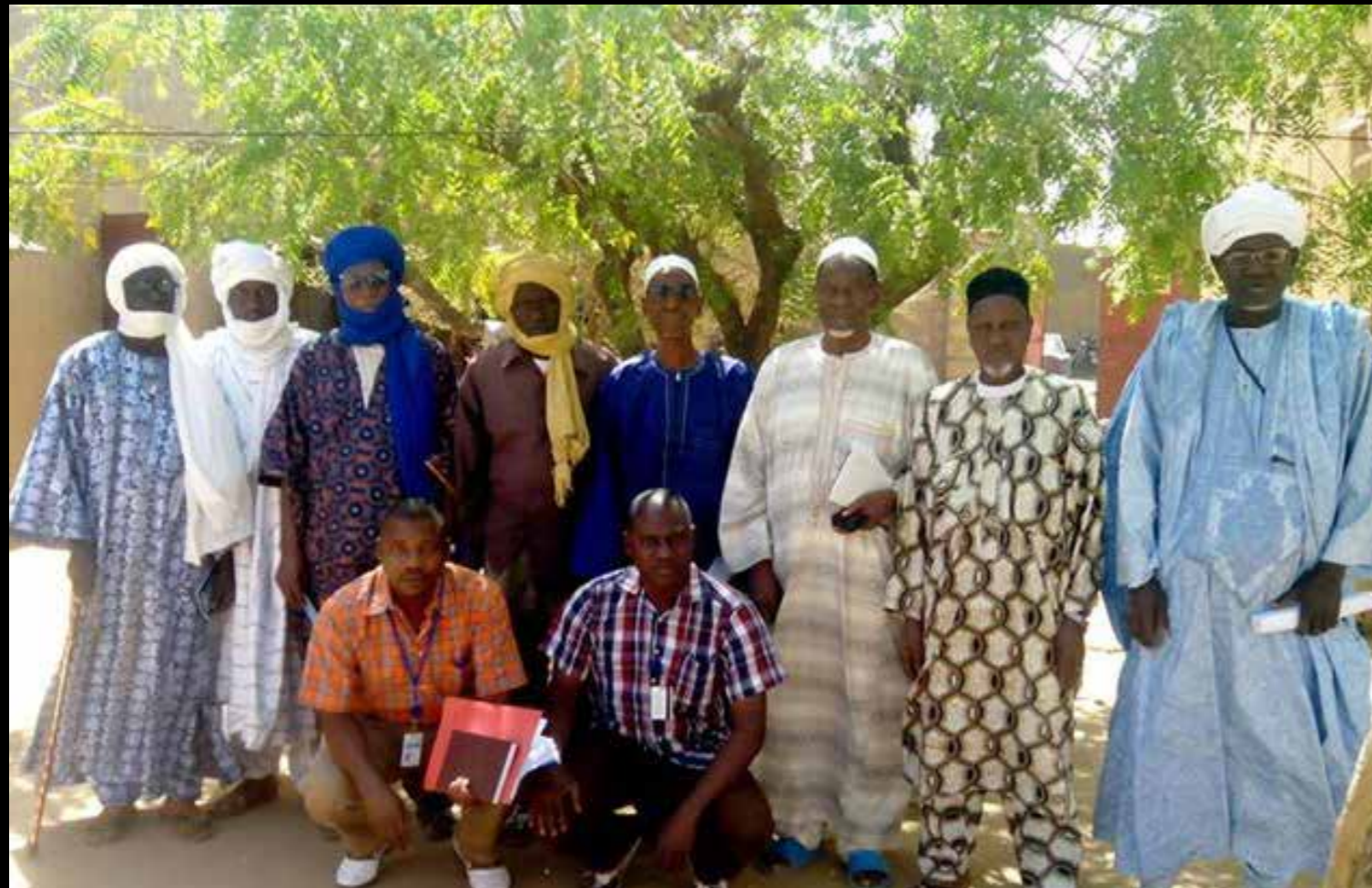
Sensitization session with neighbourhood chiefs in Gao, April 2014