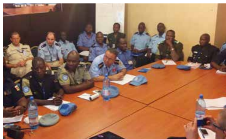
UNPOL officers in training, Bamako, April 2014