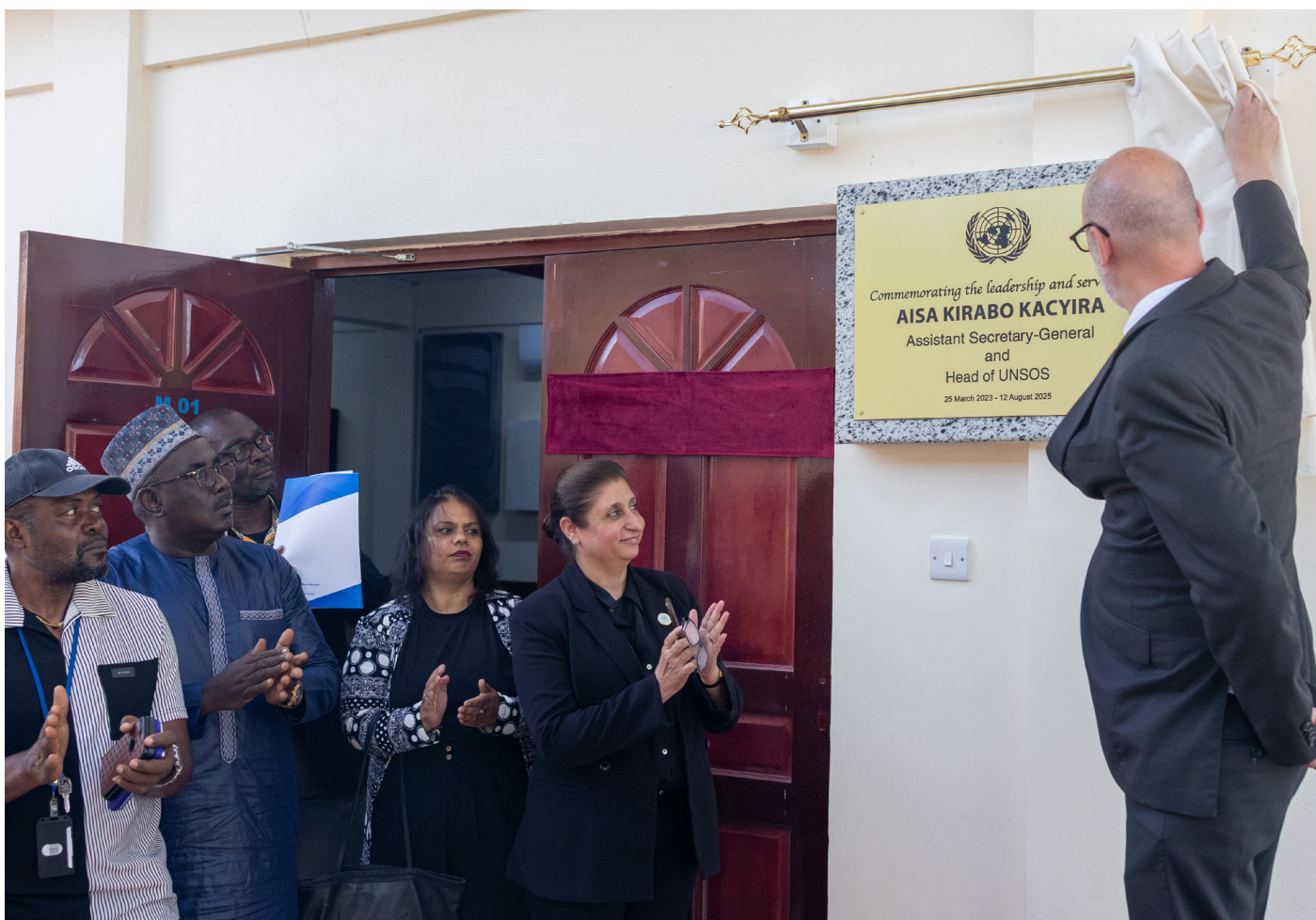
The event was marked with the laying of wreaths and inaugurating the Kacyira conference room in her honour as a lasting tribute to her outstanding service and leadership.